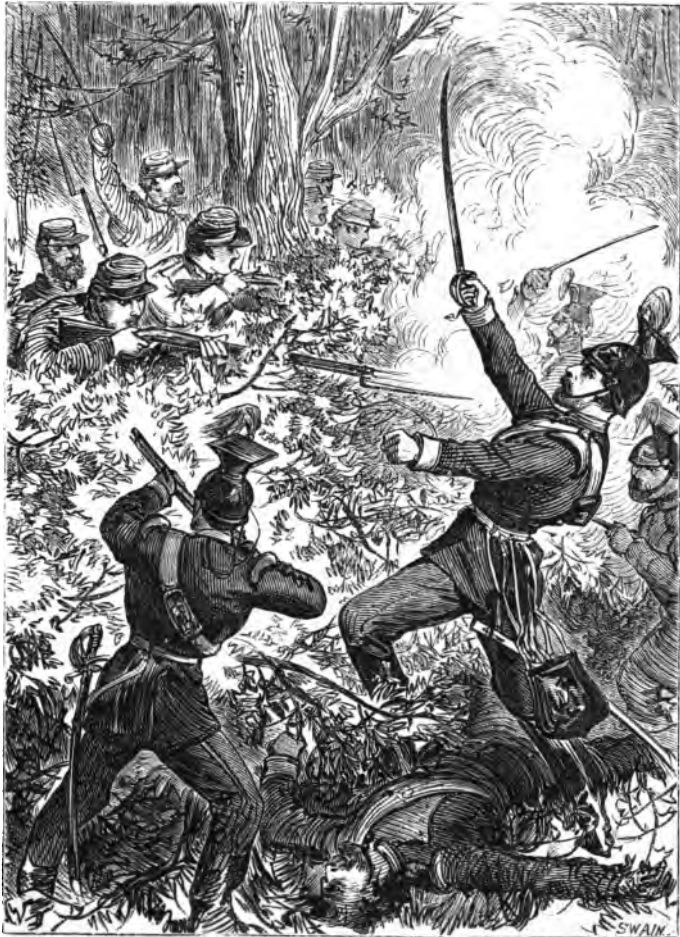
The Fight in the Wood.—Page 145.